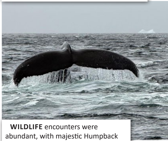
WILDLIFE encounters were abundant, with majestic Humpback whales making frequent appearances.