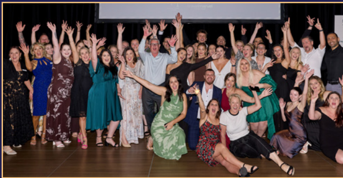
Top performing agents from Flight Centre enjoying a night of celebration