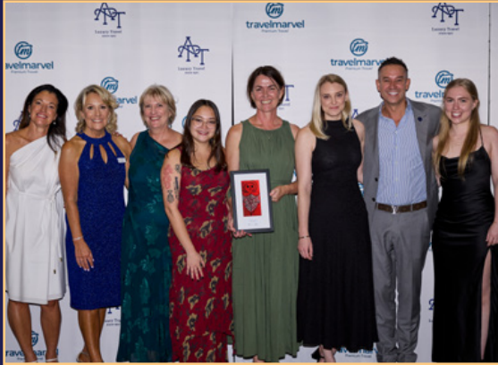
Global Journeys were awarded McGeary Club honours and celebrated their consultants all reaching the Million Dollar Club