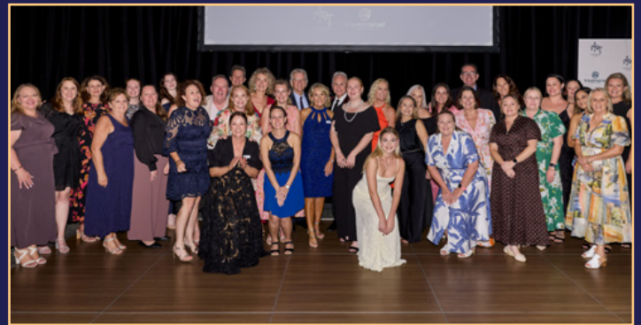
Top performing agents from Helloworld Travel Group gather to celebrate their achievements