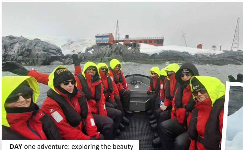
DAY one adventure: exploring the beauty of Melchior Islands.

Back on board, guests enjoyed the comfort of Viking Polar , including the Nordic Spa, six onboard dining options and enriching lectures in The Aula, the ship's state-of-the-art panoramic auditorium.