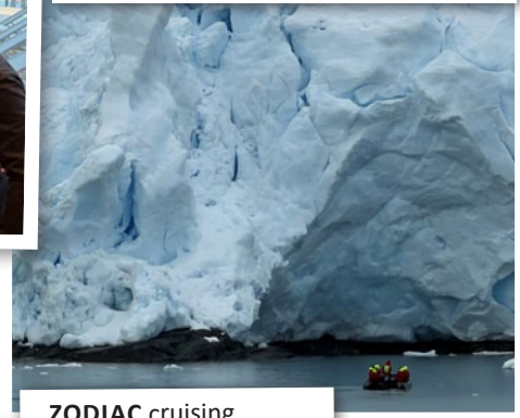
ZODIAC cruising beneath the towering ice.